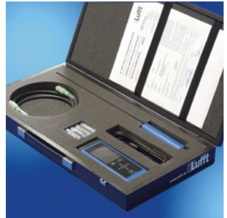
High quality wooden case and PT100 ceramic sensor are included in delivery